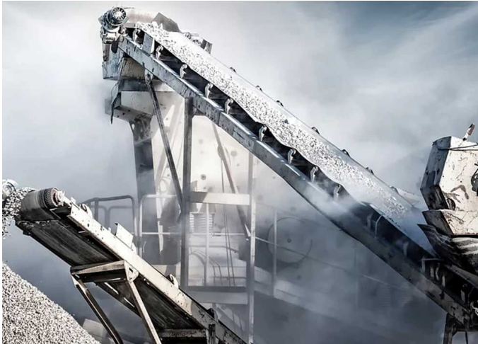
CONVEYOR BELTS AND MATERIAL TRANSFER POINTS