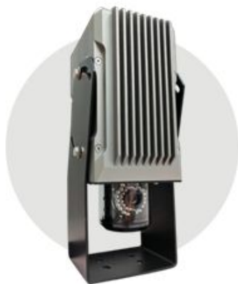
TE-3100™ Installed Inside Material Chute

ToughEye™ installed inside a material chute in Northern British Columbia allows the plant to reduce downtime by 60%, and to proportionally reduce confined space work for the workers.