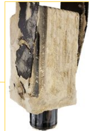
TE-3100™ 14 months After Installation, Optical Clarity Unchanged