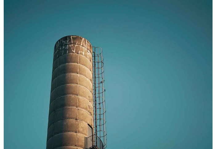
BINS AND SILOS